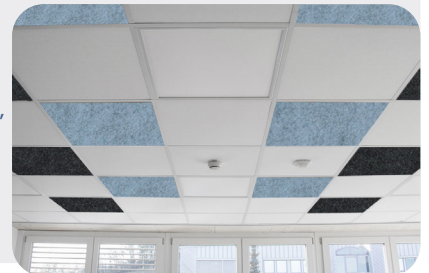
Ceiling with soni COMFORT SD and soni COLOR RD